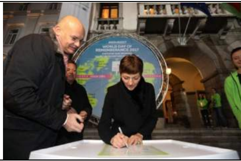
Minister of Education, Science, and Sport, Maja Makovec Brenčič