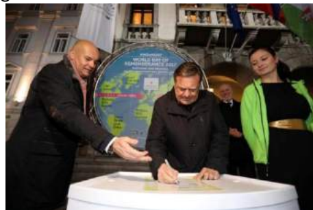
The Mayor of Ljubljana, Zoran Janković,