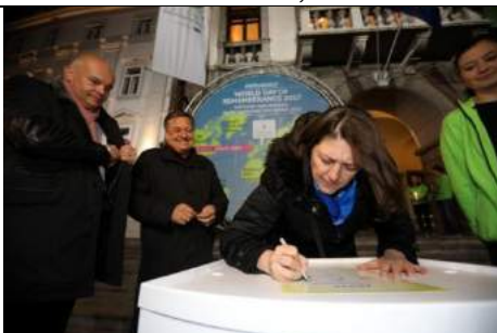
European Commisioner for Transport and Mobility, Violeta Bulc