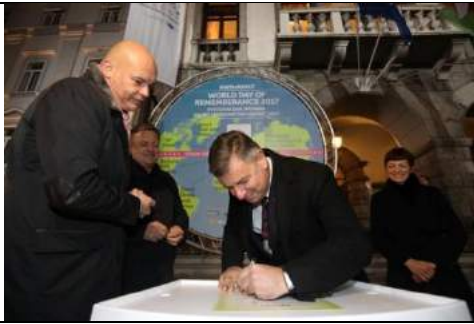
The Slovenian Minister of Infrastructure, Peter Gašperšič