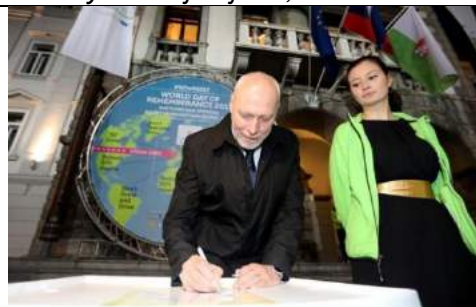
The President of the National Assembly of Slovenia, Milan Brglez