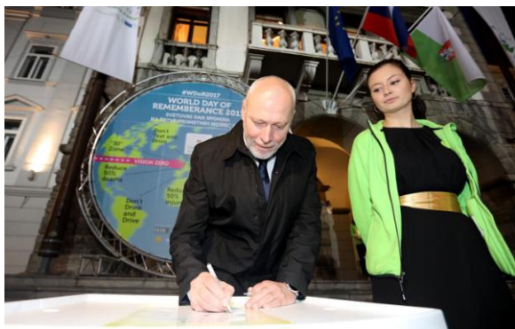
The President of the National Assembly of Slovenia dr. Milan Brglez

The signatures were obtained throughout the whole day on Stritarjeva Street in Ljubljana where no less than 250 signatures were gathered. The following people also signed the petition before entering the Town Hall: