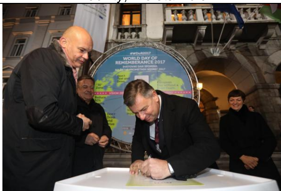
the Slovenian Minister of Infrastructure, Peter Gašperšič