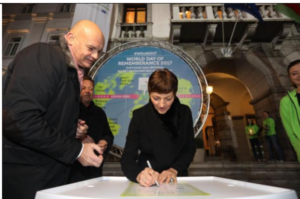
Minister of Education, Science, and Sport, Maja Makovec Brenčič