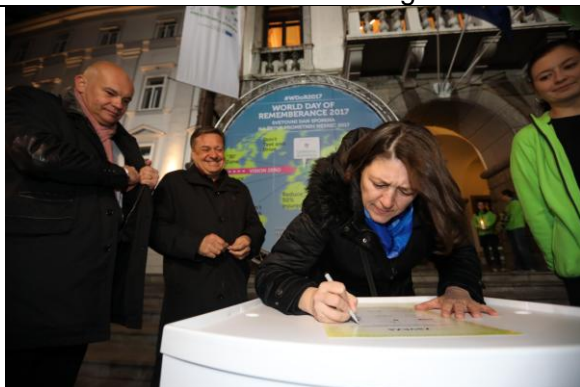
European Commisioner for Transport and Mobility, Violeta Bulc