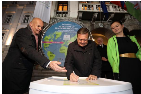
The Mayor of Ljubljana mr. Zoran Janković,