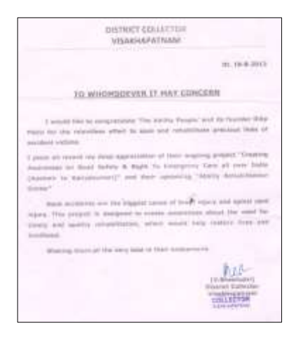
DISTRICT COLLECTOR SUPPORT