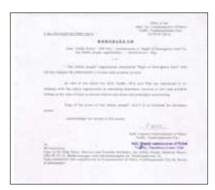
TRAFFIC POLICE VISAKHAPATNAM