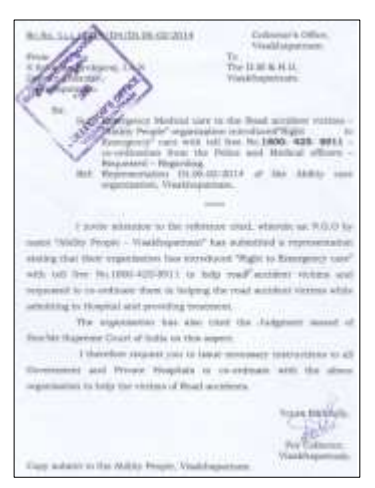
RIGHT TO EMERGENCY CARE TO THE DISTRICT MEDICAL OFFICER