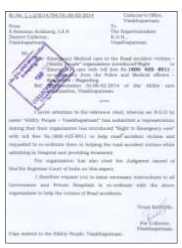
RIGHT TO EMERGENCY CARE TO THE GENERAL HOSPITAL. VISAKHAPATNAM