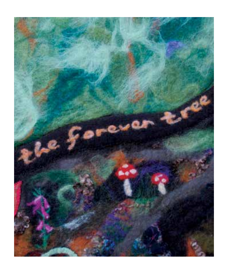
the tree that felt love never leaves